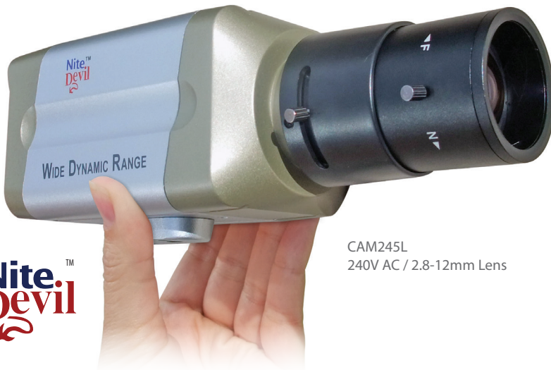
CAM245L 240V AC / 2.8-12mm Lens